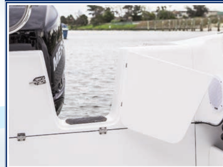
Optional walkthrough transom for superior deck access