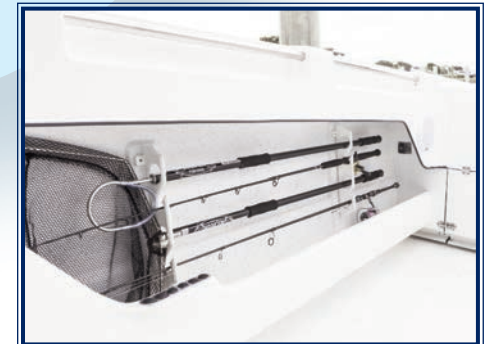
Large side pockets and recessed hand rails are a must for serious offshore fishing