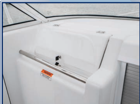
Large lockable glove box keeps all your personal items safe