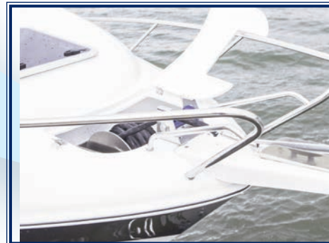
Large anchor well can accommodate electric anchor winch without any further modifications